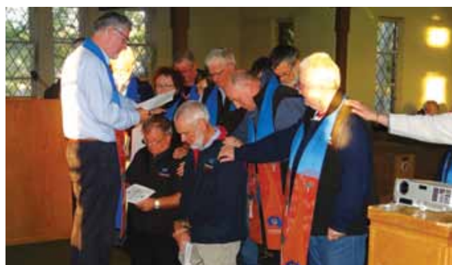
The College Chapel was used to induct a new Patrol Minister