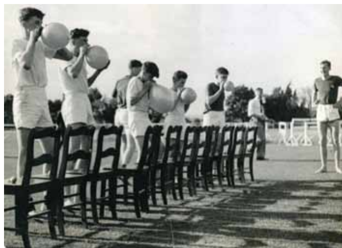
Can you identify any of the people in this 1940s athletics photo?

archival information to be kept. Every time I visit an antique shop and note the beautifully framed but anonymous nineteenth century photographs and bereft photograph albums I feel pain knowing that there will probably be family descendants and historians somewhere for whom these would be their treasures.