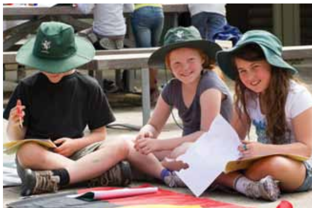
Year 3 students take part in an Indigenous craft activity