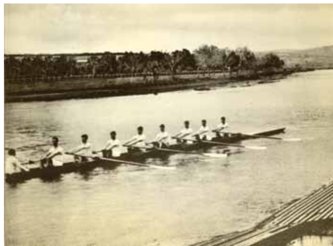
Unidentified rowing image from circa 1910

Sadly, I have several boxes of College images, some dating from the 1890s, for which provenance has been lost or there was simply no original identification. I know that one day I, or better still my successor, will have to make a choice as to which ones survive. As time goes by, the ability to identify these images declines. Many images, particularly those of unidentified people, carry insufficient