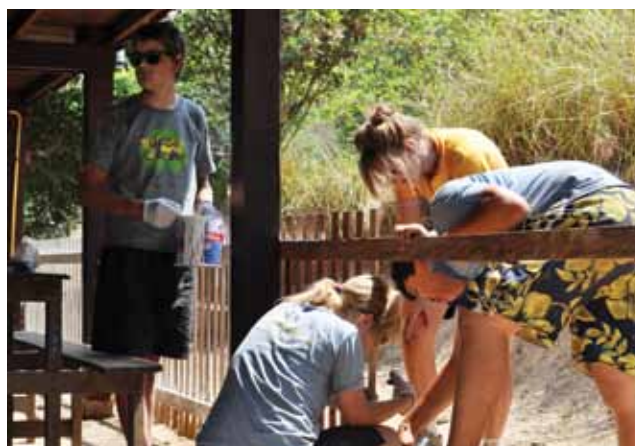
Part of the Year 12 cohort on their Fulfilling Lives trip to Thailand in 2010

There have also been two unplanned events that have marked your journey since Year 7 and had a profound effect on you collectively and, in a number of cases, at a deeply personal level. I am of course referring to the two personal