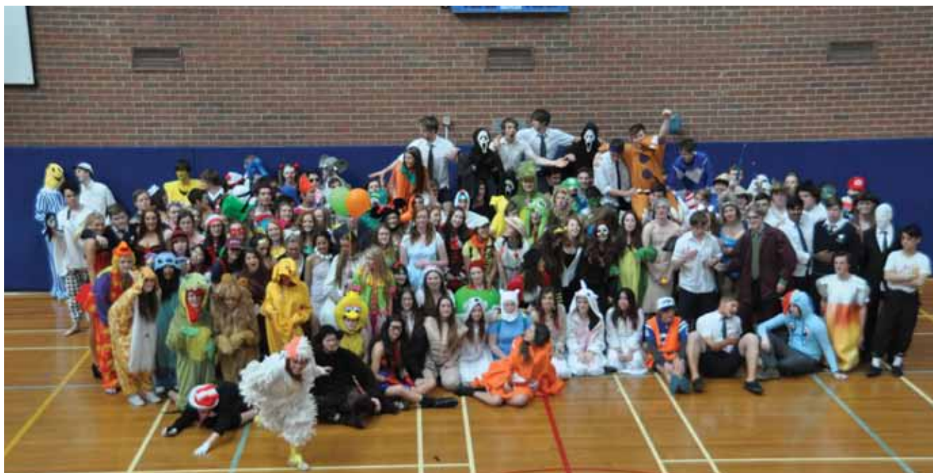
The Year 12 class let their hair down on their last day as students

Quite a few of you will take time out next year to work and travel in different parts of the world before settling down to further study. My advice to you while you are abroad is to seize the opportunities that will come your way to broaden your horizons. Connect with different people, not just Australians. Get off the beaten tracks of tourists when you travel. Be culturally adventurous. Find out what makes other people tick. You have been to Borneo or Thailand or Tanna Island or to the centre of Australia as part of your Year 10 experiences. You know the value of sharing the lives of other people and exploring the culturally unfamiliar: different perspectives open up enabling your personal values to deepen and mature. Even if these new perspectives don't determine the career you ultimately decide to pursue, they help to shape the person you are and the decisions you will make as a citizen.