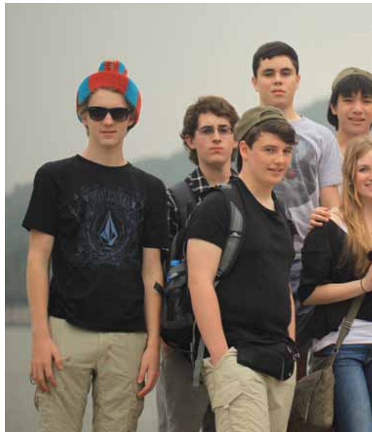
The Geelong College China trip was a memorable experience for the eight students and two teachers

Shanghai was our final destination where the group embraced China's more modern culture. As the most populous city in China – more than 23 million people, more than the population of Australia in just 6,340 square kilometres. Shanghai represents the modern China, and with new buildings; Shanghai was different to all the other cities that we had visited. From walking on the sky to finding our way around a maze of buildings in the water village, Shanghai proved the saying "saving the best for last".