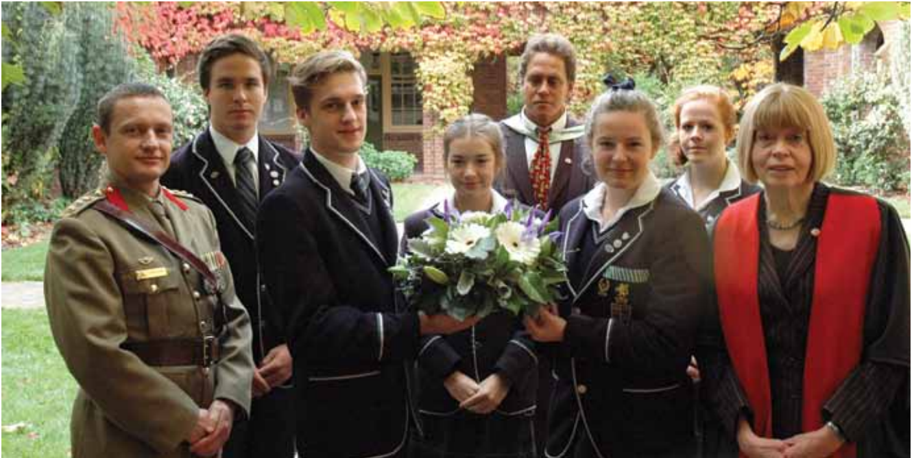
ANZAC Day in the Cloisters

The world is an incredible place full of promise, as I said. Many of you will have the opportunity to contribute to a growing creative workforce which embraces many more professions than normally associated with the concept of "creativity" such as scientists and engineers, architects and poets, people in design, education, arts, music and entertainment, anyone whose function is to produce new ideas, new technology or creative content. Even business managers can fall into this category if their primary role is to think and create new approaches to problems. As a generation, you are poised to develop in freer and