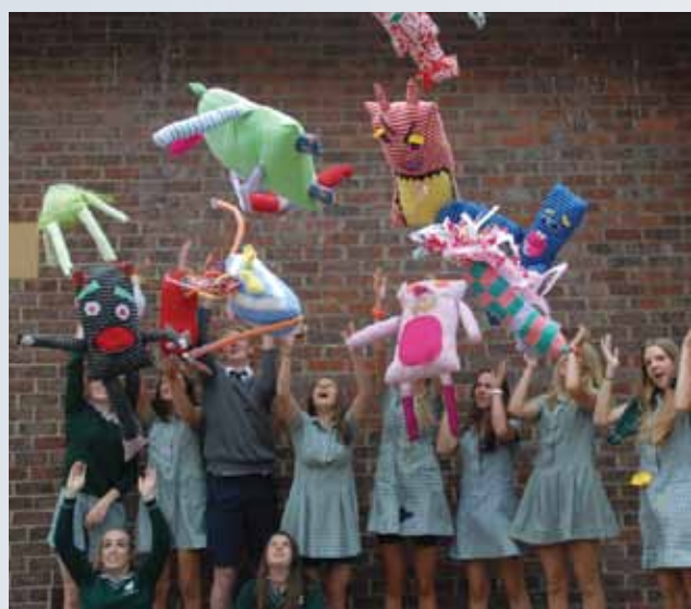
Toys made from recycled materials and given to Cottage by the Sea

At lunchtime students participated in the Simply Sharing Lunch. On entering the Dining Hall each student drew a ticket out of a bowl and was randomly allocated to meals representative of developed, developing or less developed countries. This helped to raise awareness of how we live, and how our use of resources impacts on others. It specifically raised consciousness of the issue of hunger throughout the world.