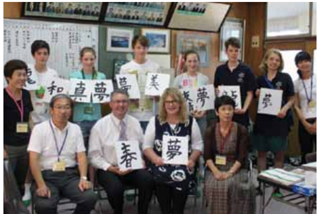
The cultural experience for students and staff in Japan incorporated traditional culture, music food and some relaxation