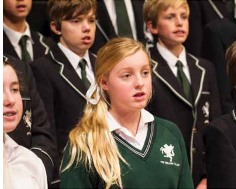
The Foundation concert is a highlight of the College calendar

In October it was my pleasure to host a Cocktail Party at Deakin Waterfront Campus. This event was a wonderful opportunity not only to recognise and thank our many Foundation and Morrison Society members but a very fitting