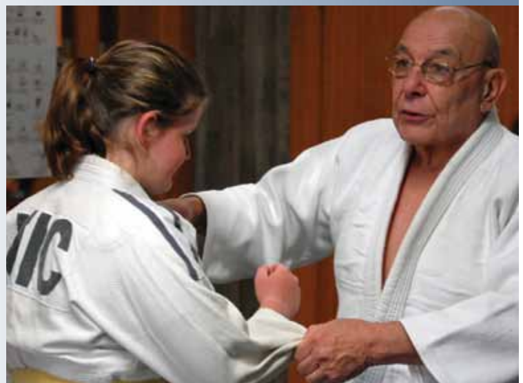
A Judo lesson was a new experience for many students