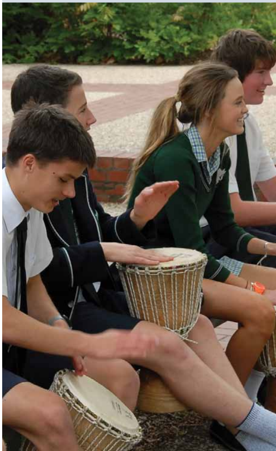
Students take part in African drumming in Helicon Place