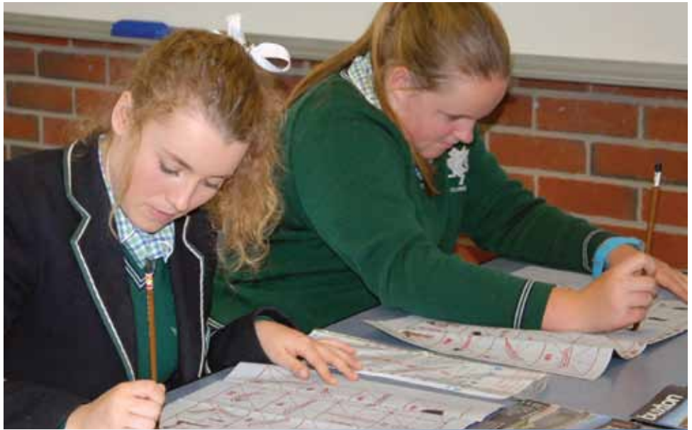
Chinese calligraphy was one of the afternoon activities