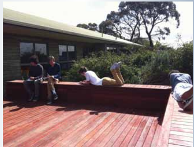
A three day creative writing experience was a great success

with writing narrative texts, where the setting drives the story, rather than the plot or the characters.