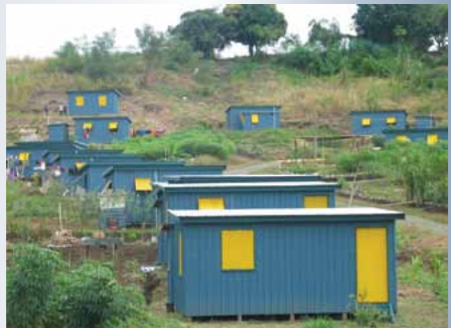
Simple but functional family homes

Funding for this project has come from the New Zealand Government, NGO's and Rotary Clubs. The recent cyclone Evan just before Christmas battered the island nation with winds of up to 200km/h which left a trail of destruction. This serves as a reminder that our Old Collegians are undertaking much needed work and are making a real difference in people's lives.