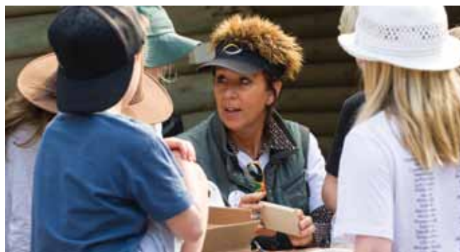
The Mokborree setting provided the Year 3 students with a fabulous environment for developing an understanding of Aboriginal history