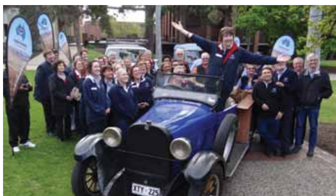
Frontier Services arrive at The Geelong College in style