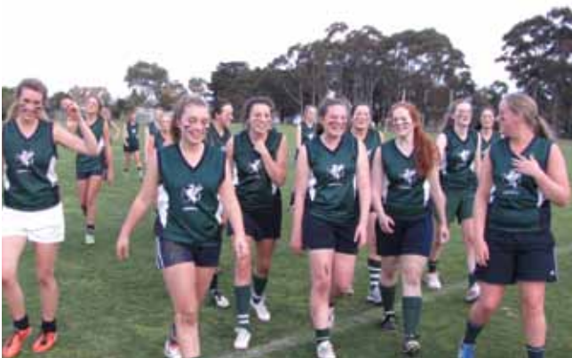
The Year 12 Girls' Football team leave the field