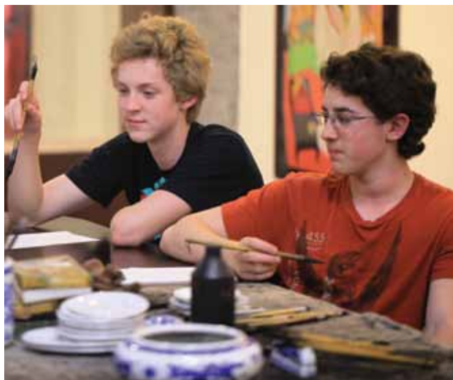
Authentic calligraphy lessons in China

With many of us eager to try a local delicacy or two, food like we'd never imagined seemed to make its way onto our menu. Silkworms, stinky tofu, hot chillis and 100 year old eggs were just some of the inclusions. The group devoured an amazing Peking Duck banquet, a highlight for many of us.