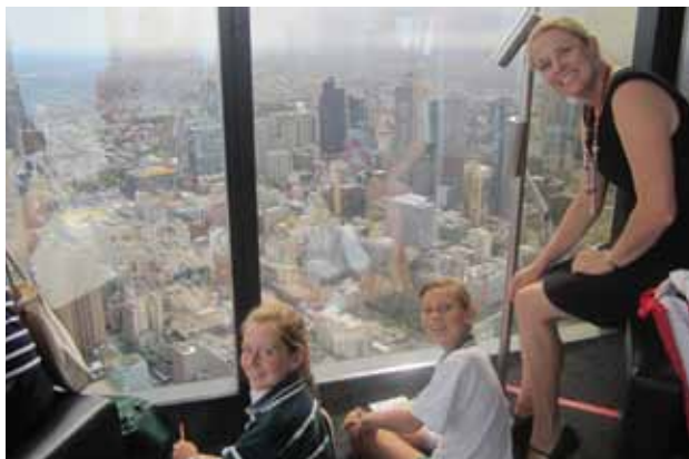
Year 3 students visited Melbourne's Eureka Tower and Federation Square precinct to experience the many aspects of a city.