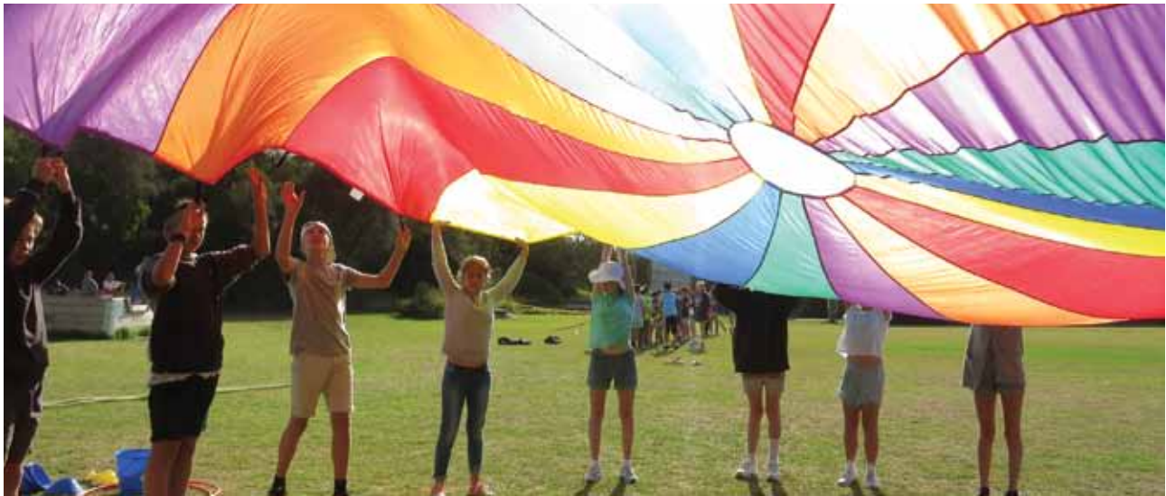
The Year 7 students had a chance to try new things, take risks and move outside their comfort zone during the Portsea Camp in February.