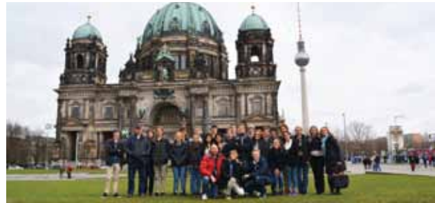
Four staff and 23 students toured sites in Berlin, Paris, Versailles, Ypres, St Petersburg and Moscow during the European History Tour.