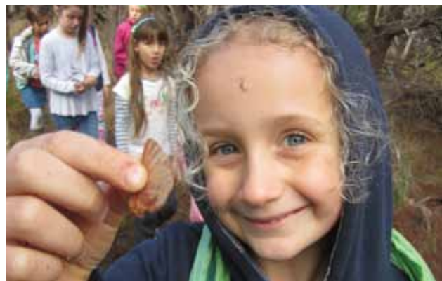
Junior School students explored the Ocean Grove Nature Reserve on Green Day to learn more about the world around them.