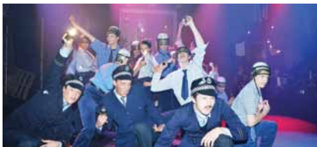
Talented Year 12 Theatre Studies students performed the satirical musical Urinetown to sell-out crowds.