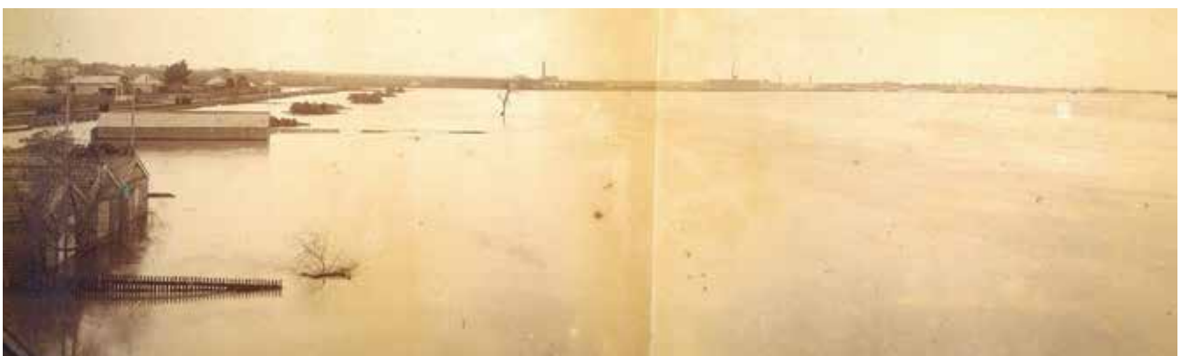
Belmont Common became a sea in the 1891 flood.