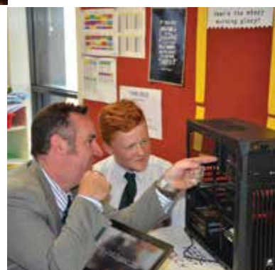
The 2015 Cre8 Expo was another success, with a wide range of projects on display