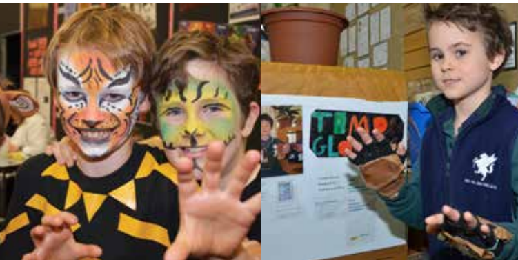
Robertson Hall was bursting with creativity on the Year 3 Performing Arts Evening