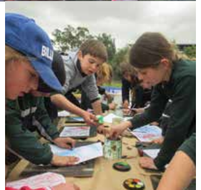
A two-day art workshop broadened 24 Middle School students' exposure to the arts