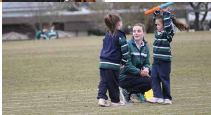
Year 11 PE classes helped coach Grade 3 and Prep students in a valuable cross-campus experience