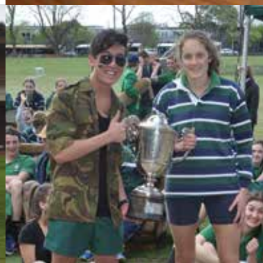
Keith House won the Senior School House Athletics trophy on its way to winning the overall House Cup