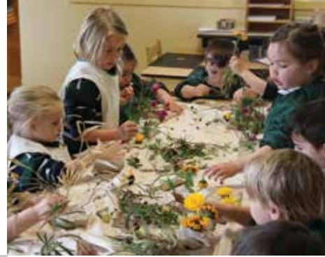
Early Learning 3 children making a garden from clay