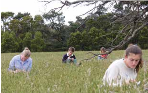
A writers' workshop at Mokborree inspired our Year 8 writers