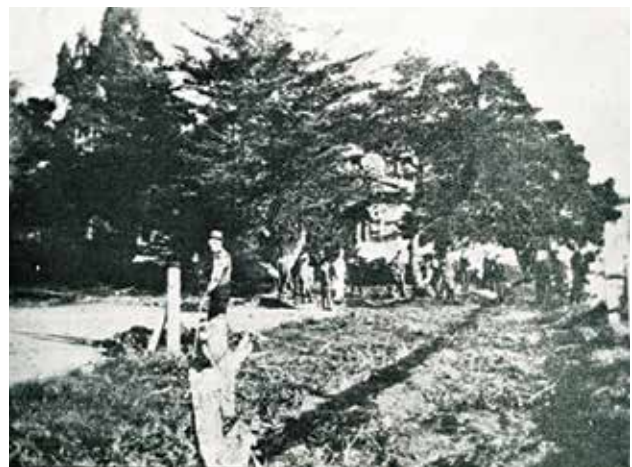
Morrison Hall Tree Clearing.

Pegasus , in its unique period style, opined: "We got some excitement out of the stump blasting. The six charges duly went off, and at the first of them everybody who possibly could bolted to see the fun. They saw little save a 'Sulphurous canopy' of smoke, for the fun was reserved for VC who were compelled to evacuate Room I by a stray lump of pine wood."