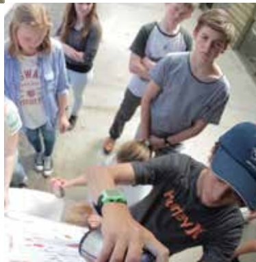
Getting creative in the Mt Rothwell Biodiversity Interpretation Centre