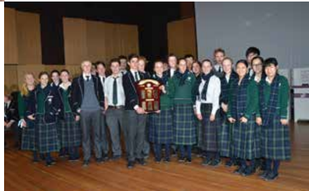
The Page United Party (PUP) won the 2015 Year 10 College election through astute preference deals