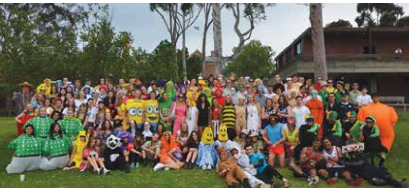
The Year 12s let their hair down and dressed up for their final day of school