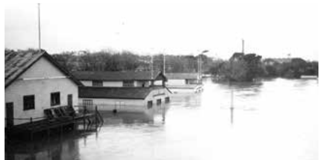
College boatsheds during the Barwon Flood of 1952 (Holmes album).

However, floodwaters were not the only threat to College boats and students. In 1912, a College crew was fired upon during a Saturday excursion. "They were fired upon by a band of youthful desperadoes, and though they fortunately escaped uninjured, the boat ('Khalifa') suffered considerable damage. One of the attacking party, we hear, succeeded in shooting his own thumb, but under the circumstances it is difficult to summon up a great amount of sympathy for him. The offenders were dealt with at the Geelong Children's Court, and we trust that their opportunities for performing similar deeds of daring will be restricted for some time to come."