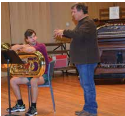
Renowned brass musician and teacher Dan Mendelow worked with students during a visit in September