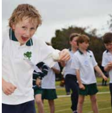
The Junior School Athletics Carnival was all about fun and participation