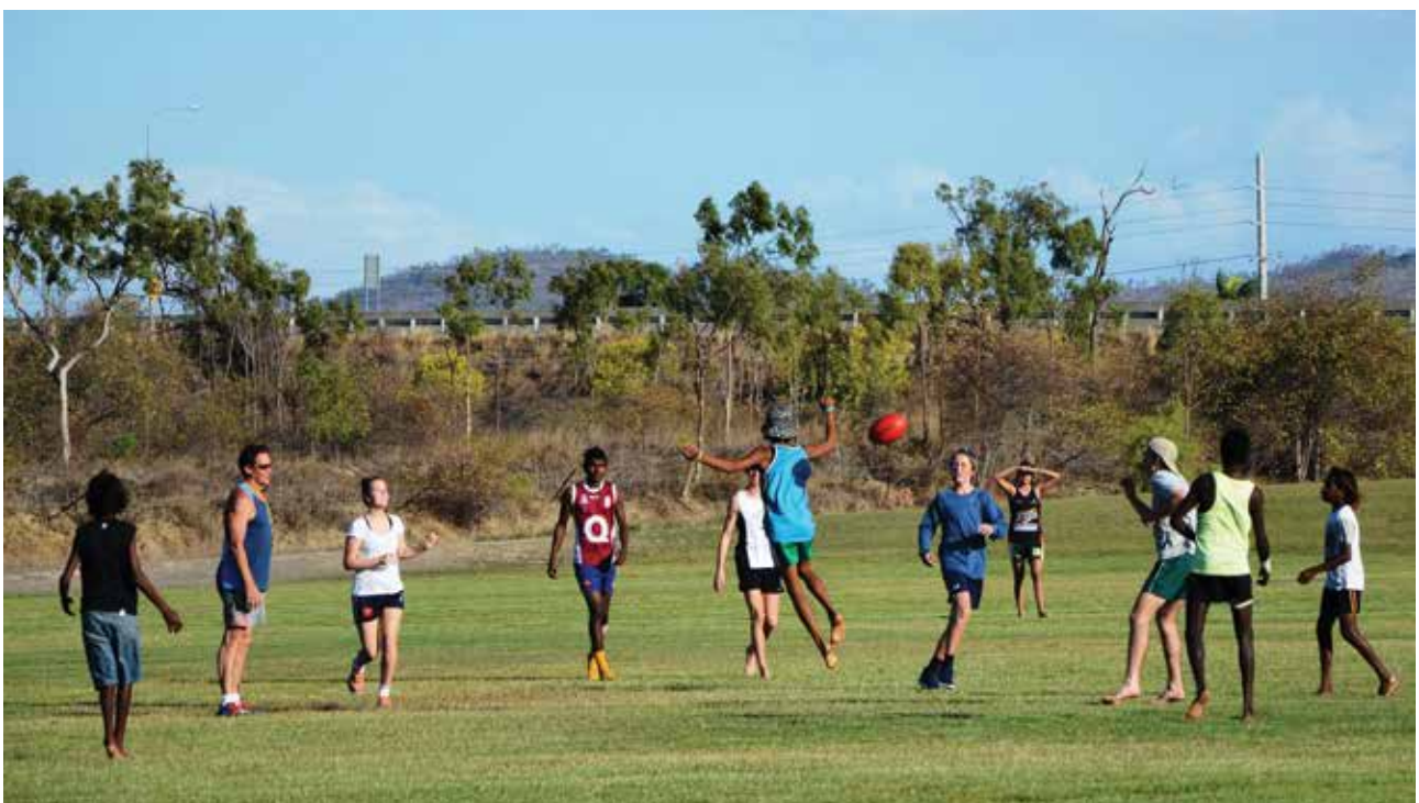
The hotly contested Shalom vs Geelong football match.