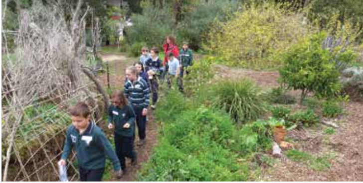
The Enviro students shared their knowledge with guests from East Geelong's St Margaret's Primary School