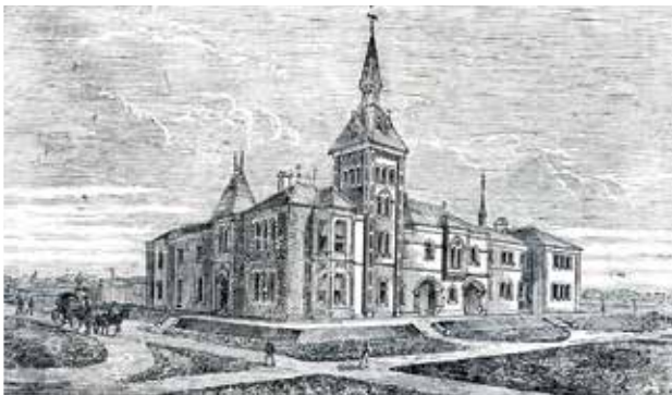
An architect's drawing of the proposed College.

"The boys in their free time used to congregate around the workmen and help them with the work. One boy in particular developed a genius for stone carving, and carved some of the freestone which now forms part of the porch. The oriel window had been completed, and the workmen were engaged on the walls behind it at lunch time one day. The crowd of admiring boys had just trooped in to the dining room when, without any warning, the whole of the upper works of the porch fell out with a crash. Five minutes before it would have fallen on the group of boys below."