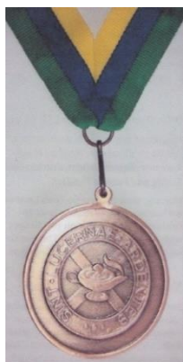
The Morongo Medal

Twenty two schools, comprising mainly of Year 9 and 10 girls, competed in this year's regatta held on the Barwon River on Saturday 4 February. The weather was good for rowing and Loreto, Toorak came out on top with 17 medals.