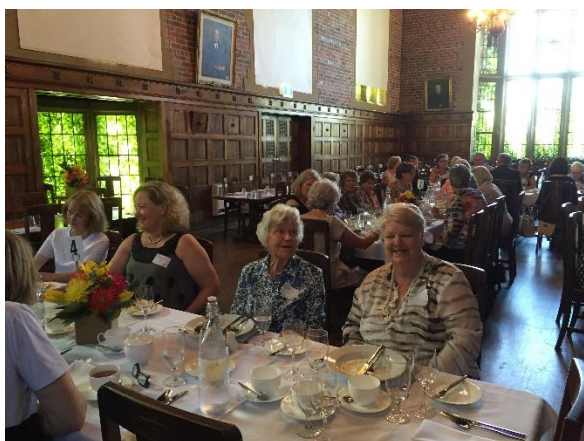
Lunch in Geelong College dining hall.

Thankyou Geelong College and all those responsible for the organisation of the day.