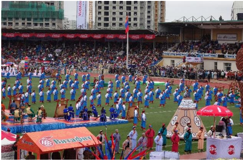
Archers at the Archery Competition, Naadam Festival

A visit to the archery stadium was also really entertaining although we took a while to begin to understand what exactly was going on.