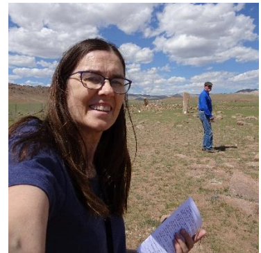
My husband & I checking out the Deer Stones near Murun