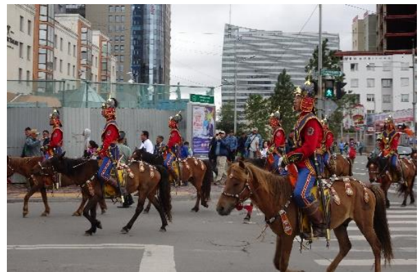
Horses and Soldiers accompanying the Standard from Parliament House, Ulaanbaatar to the sports complex for the opening of the Naadam games

The 5 day Naadam festival in July consists of wrestling, archery and horse racing. Mongolians have been competing in these three sports since at least the 13 th Century and they remain very important activities today.