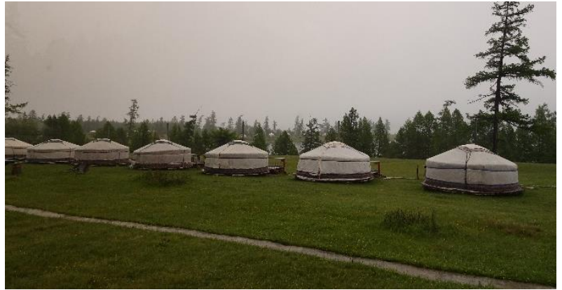
Tourist Ger Camp

Options to travel further afield are also available. We have enjoyed taking the overnight train to Sukhbaatar, a town close to the Russian border. On that trip we were able to walk right up to the border marker between the two countries and we visited the revolution museum which was excellent. From the train, we saw many small settlements and in the distance we could see the ger camps of the nomads who still live off the land as they have done for thousands of years.