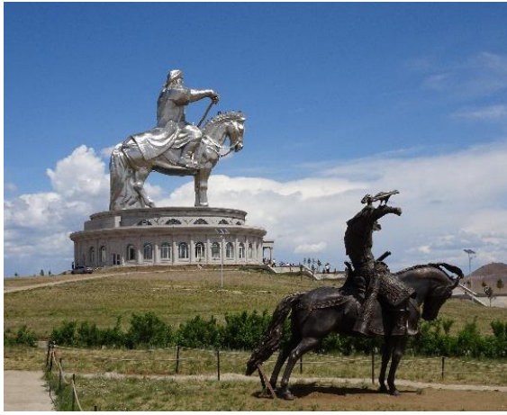
The huge Chinggis Statue at Terej National Park