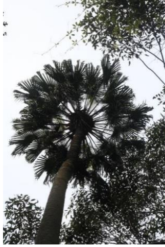
Cabbage Tree Creek Walk