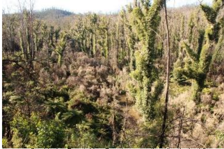
Combiobar Forest drive. Forest regeneration after the bushfires.