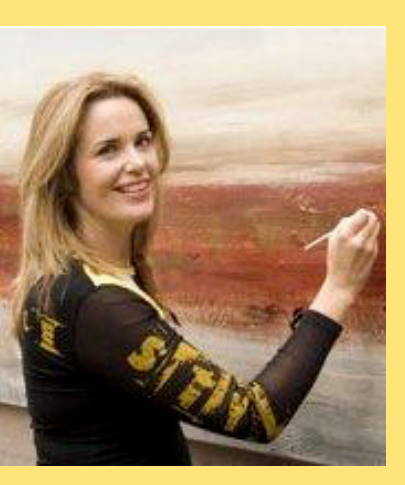
Instagram at georgiegallart